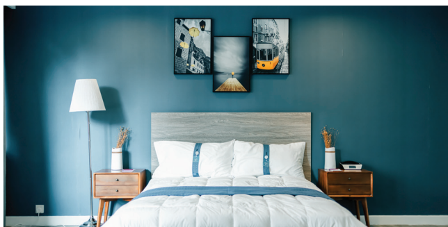
Simulation Guest Room