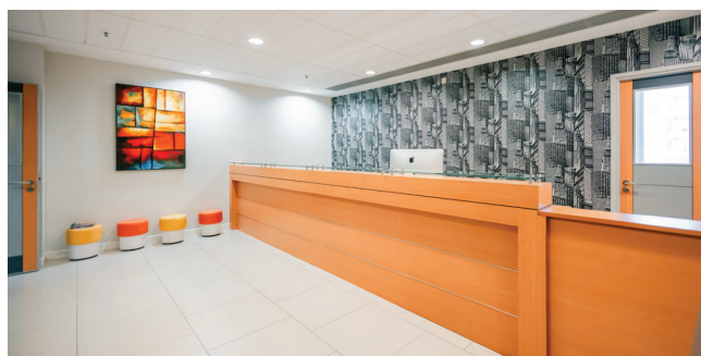
Simulation Front Desk